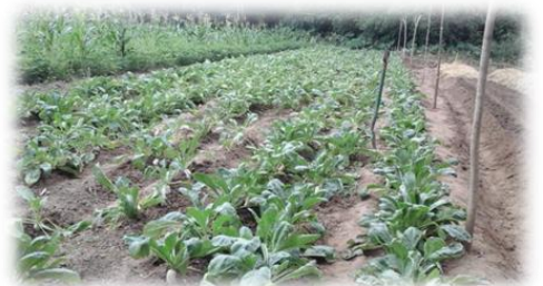
School & community garden