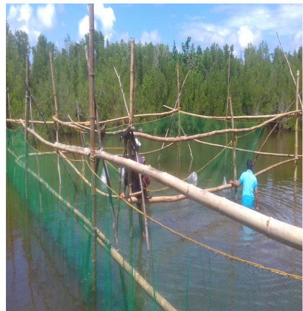
Aquasilvi-culture program at Sitio Cabalian, Agmanic