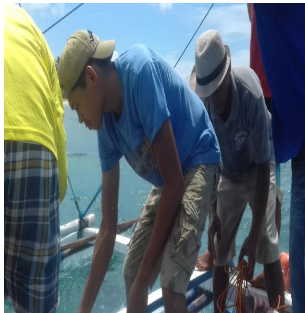
Installation of marker at fish sanctuary