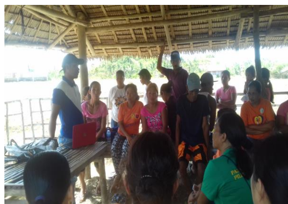
Orientation on sustainable fishing at barangay Magsaysay and Canyayo