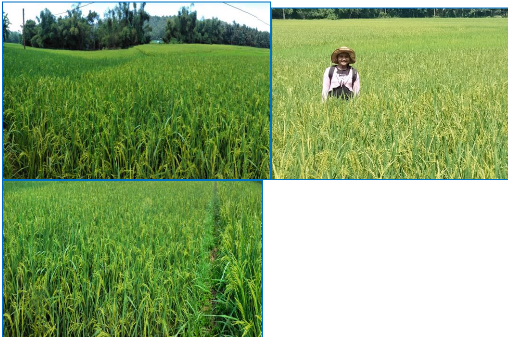
Hybrid rice farm located at barangay Danao Norte and barangay Guinbirayan

In the dry season, 566.9 hectare was planted in both irrigated and rainfed areas. It was noted that 566.9 hectare was also harvested during this season. The yield obtained from our 5 hectares hybrid farm located in barangay Danao Norte (2 ha) was 6.2 mt and 6.1 mt in the hybrid farm located in barangay Guinbirayan. For our Seed Exchange Program, 7.5 hectares of rice field located in barangay Pandan and barangay Guinbirayan was planted and harvested utilizing registered seeds. The average yield obtained during dry season was 5.3 mt per hectare and 5.34 mt during wet season. The total area planted during wet season was 30.04 hectares located in different barangays of this municipality. Our farmer beneficiaries enjoyed the free inputs that they received under the said program.