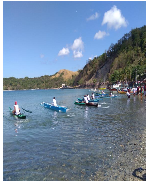
Conduct of Fisherfolks day celebration