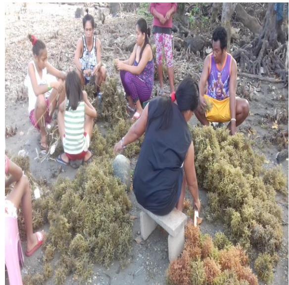
Seaweeds seedlings distribution to the seaweed farmers