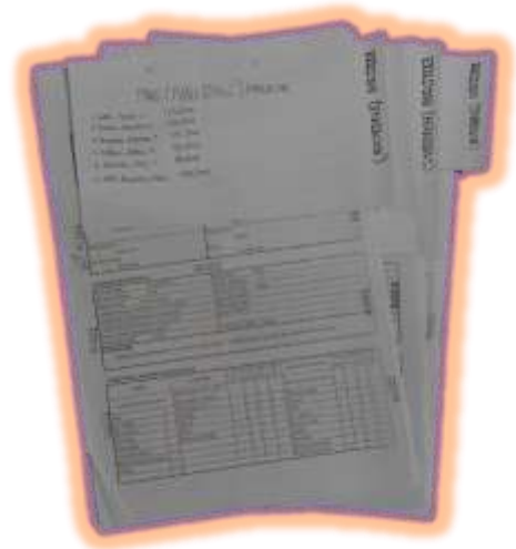
Approved Field Appraisal Assessment Sheets for Building