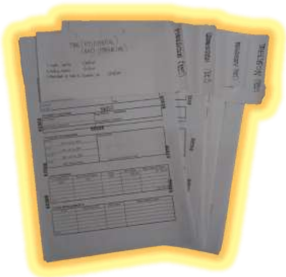
Approved Field Appraisal Assessment Sheets for Residential