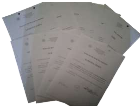
Certifications of No Property