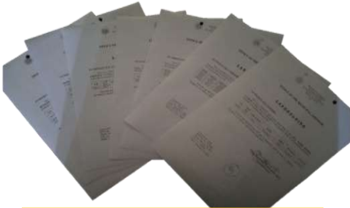
Certifications of Landholdings