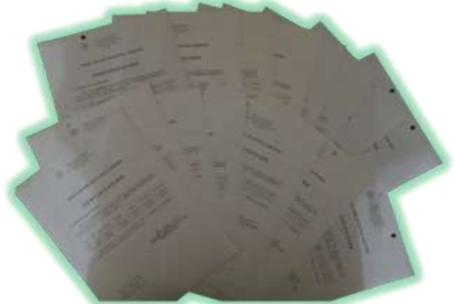
Certifications of No Improvement