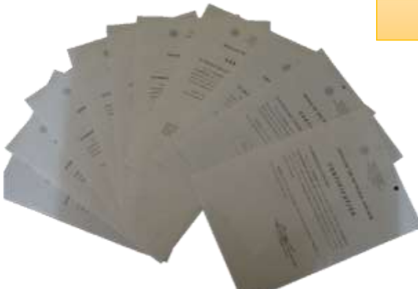
Certifications as Declared Owner