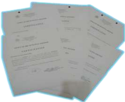
Certifications of KALAH-CIDS