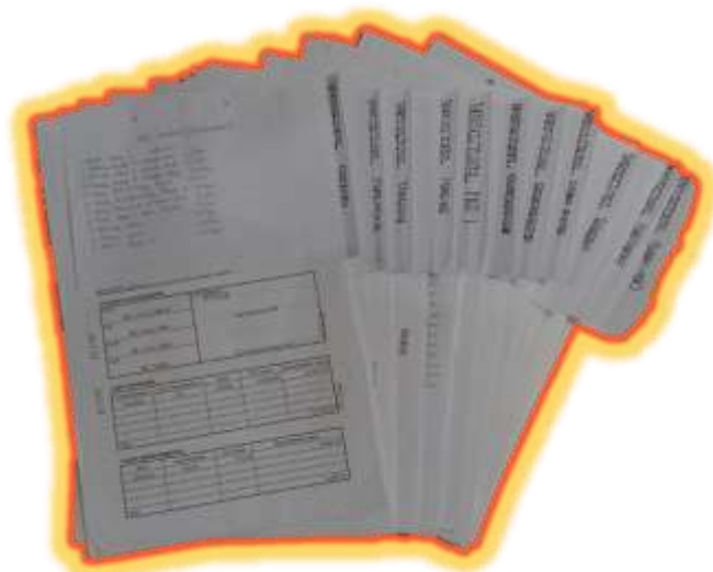
Approved Field Appraisal Assessment Sheets for Agricultural