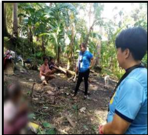
Attendance/Conduct of Provincial & Municipal Activities of People's Organization