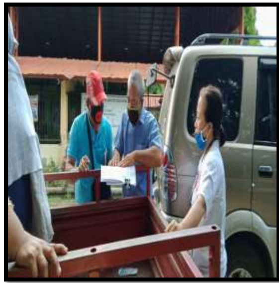
Provision of Food Packs to Families (3 rd Wave) – Bayanihan