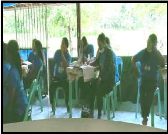
SFP Orientation to CDWs by the MSWDO