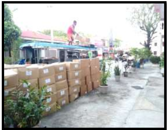
Inspection of Goods of the Inspection Committee