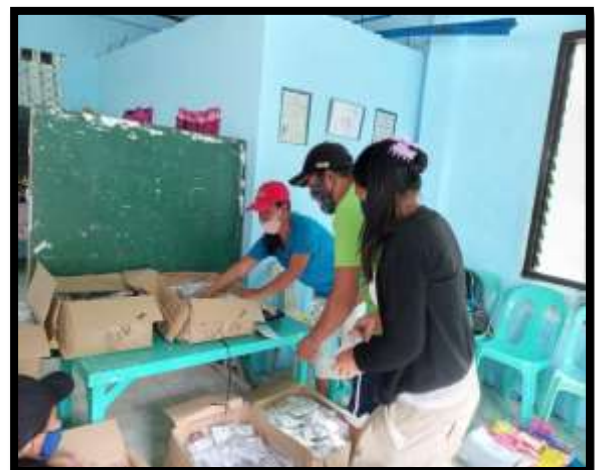
Release of goods (food stuff) to CDWs