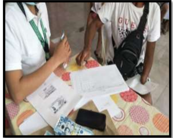
The Awarding of Centenarian beneficiary in 2019