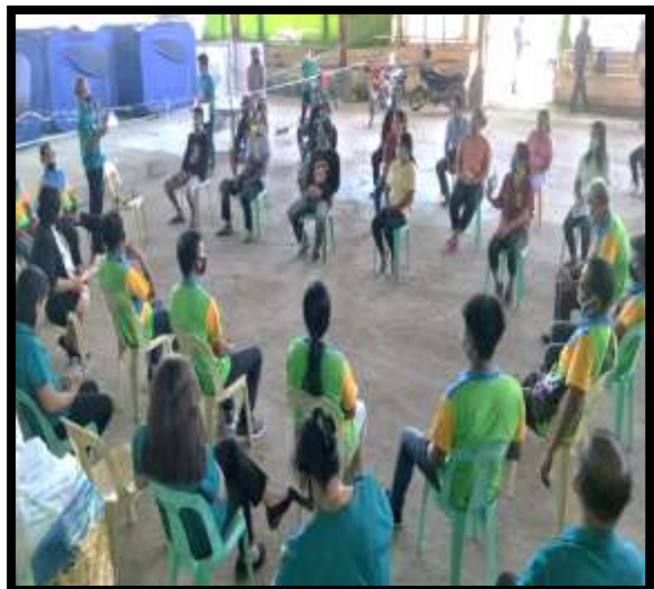
Child Development Workers' Training