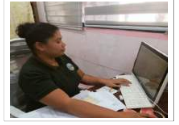
Job Order Employees